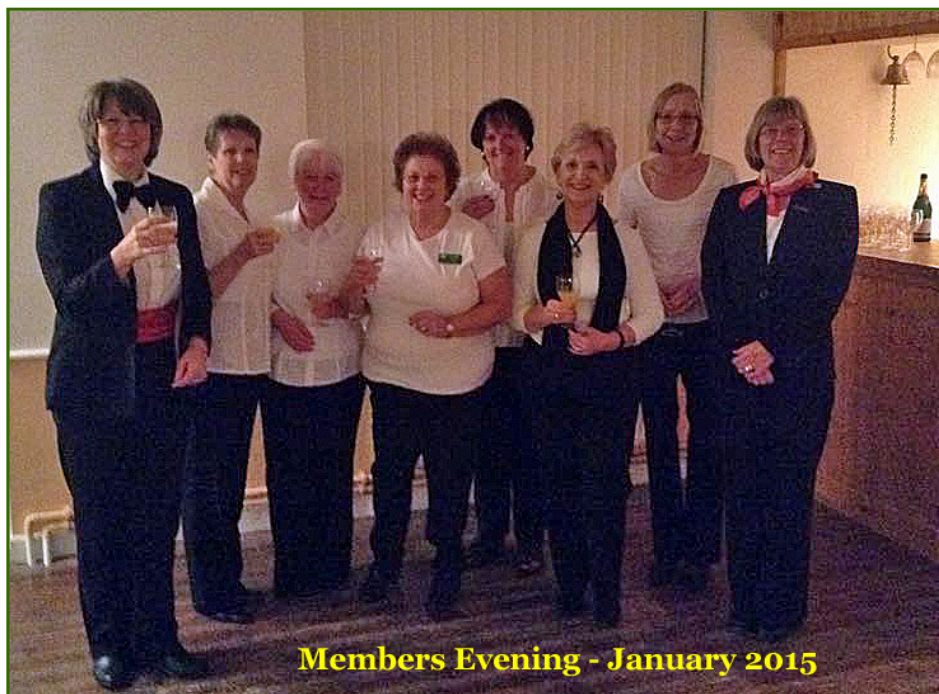
Members Evening - January 2015